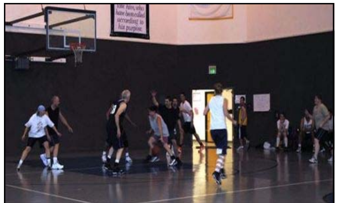
Below: On the court, crowd cheer on the side lines.

In the end, a good time was had by all and the game successfully supported the food drive as well as promoting friendship and camaraderie between PRCF employees and the contractors that show up every day to provide services to the inmates housed at PRCF.